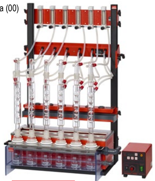
4 VAE 6 together 5 with KW 6