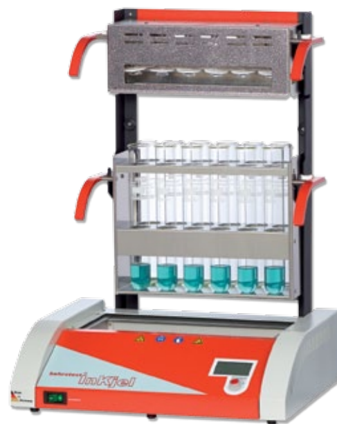
1 InKjel 1225 TCP