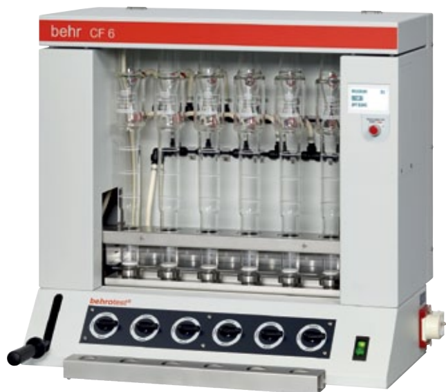
4 CF 6

Find detailed information in our special leaflet: behrotest® Equipment for the Determination of Crude Fibre