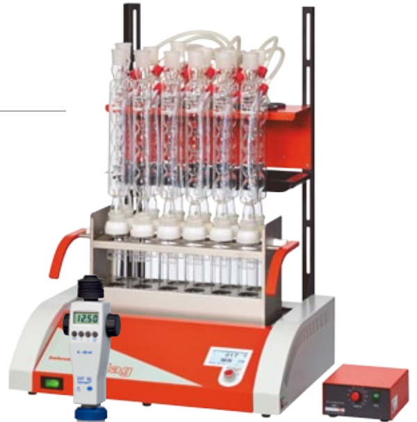
1 VFZ 12