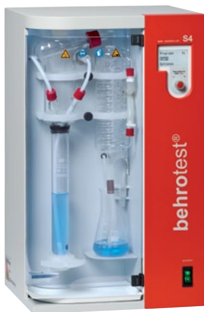
4 S 4