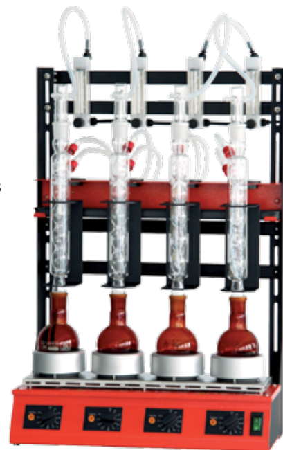
6 VAE/BG 4