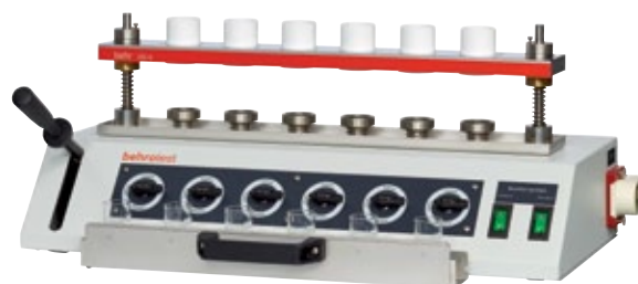
5 DG 6