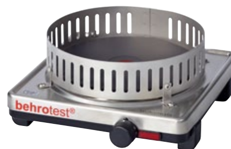
2 KP 4