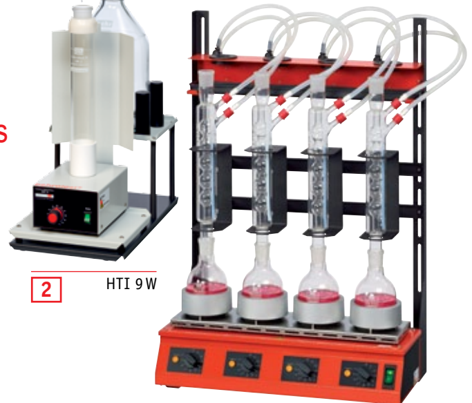
2 HTI 9W