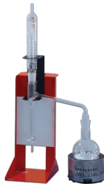
1 KWA 500