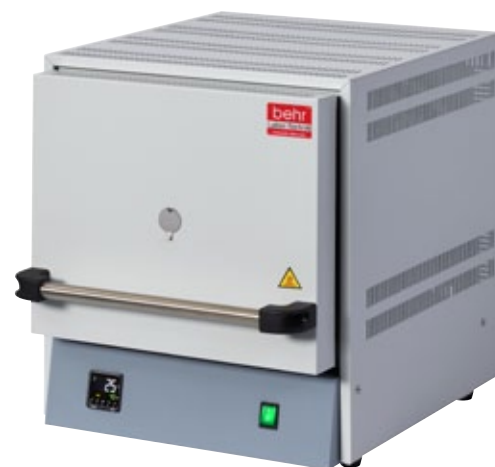
1 MO 8