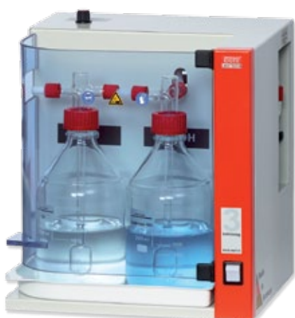
3 behrosog 3

Find detailed information in our special leaflet: Kjeldahl method for determining nitrogen