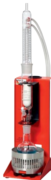
2 KEX 100 F-FB

Find detailed information in our special leaflet: The behr range for Extraction/Distillation