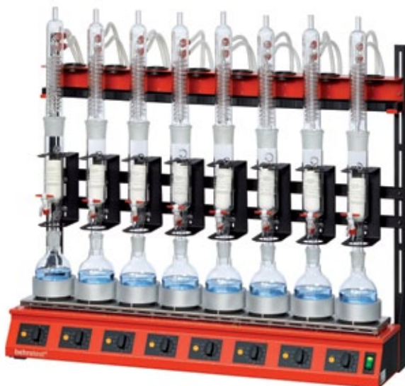
3 R 108 S