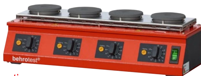
2 HB 4