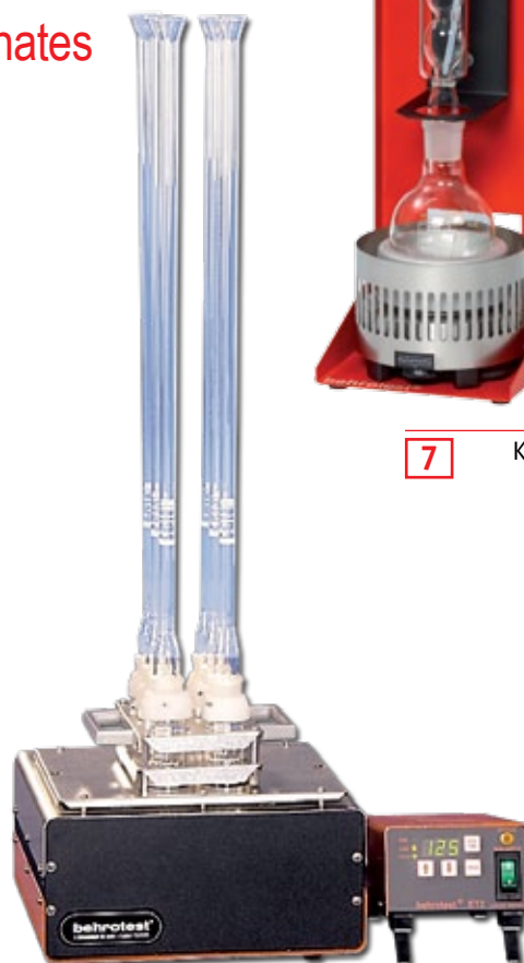
8 BE 6