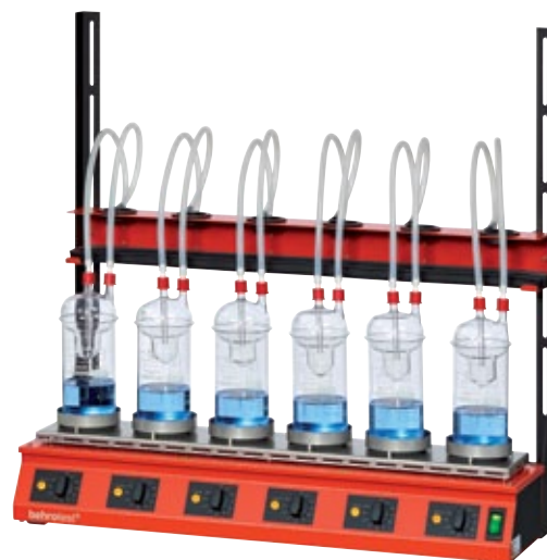
2 EXR 6

Find detailed information in our special leaflet: behrotest® Equipment for the Determination of Crude Fibre