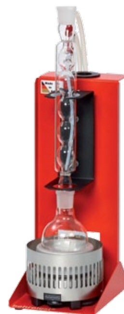
7 KRD 100