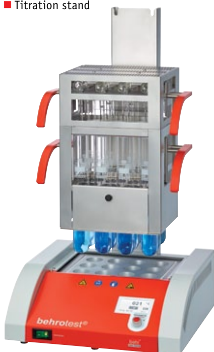
2 K 12